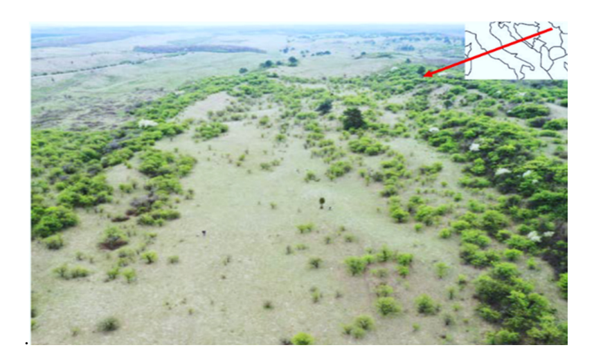
Figure 1. The location of the Project IRIS field activities.

The area to be explored (Figure 1) covers an area of approximately 4.65 ha (44°57'59.66 "N and 21°2'20.98 "E; 44°57'57.07 "N and 21°2'15.67 "E; 44°57'48.25 "N and 21°2'32.02 "E; 44°57'51.32 "N and 21°2'34.62 "E).