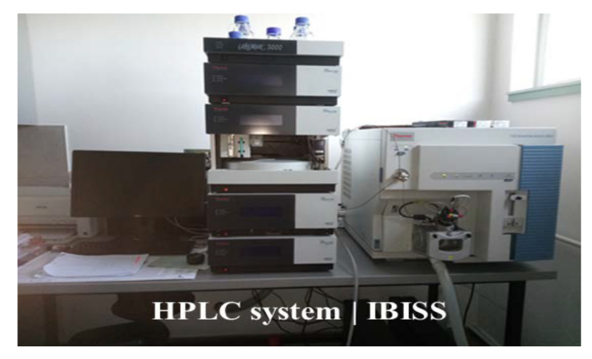
Figure 5. HPLC system in IBISS

High performance liquid chromatography (HPLC) is a method suitable for detection of large biological molecules, and will be utilized for detection of various pigments in I. pumila (Figure 5). Three groups of pigments are responsible for coloration in plants: flavonoids anthocyanins and carotenoids, flavonoids and anthocyanins being the major contributors to flower color.