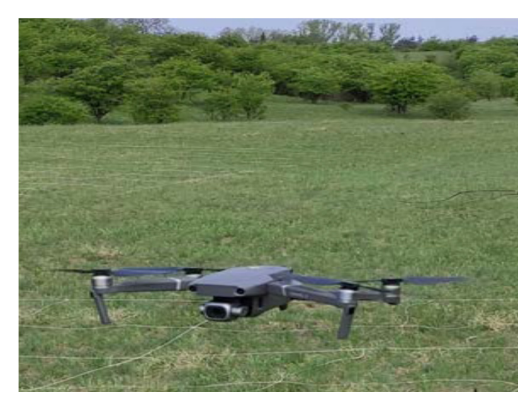
Figure 3. DJI Mavic Pro Drone flying over experimental plots.