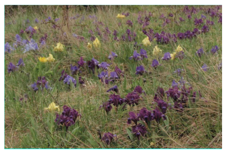
Figure 2. Iris pumila flowers in nature.